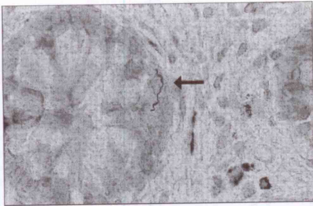
Figure 1. Colon biopsy specimen from a patient with Lyme disease. Abdominal pain and blood in the stool were symptoms. Arrow shows typical helical-shaped spirochete characteristic of Borrelia burgdorferi (Dieterle stain-magnification x522).